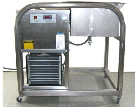
Self-Contained Batch Bottle Chiller. Chilled Water Recirculates to Cool Bottles to Desired Temperature.