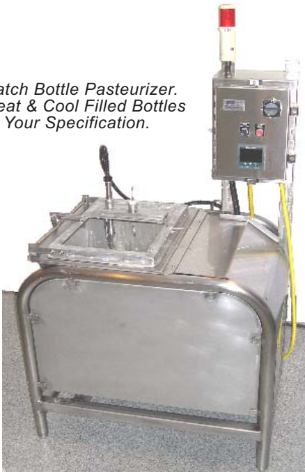
Batch Bottle Pasteurizer. Heat & Cool Filled Bottles to Your Specification.