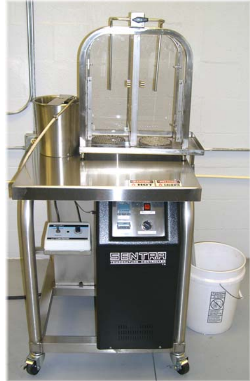
HTST Hot Fill Unit with Bottle Filler. Simple Operation. Flexible Design.